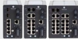
Stratix 5200 switches