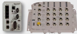
Stratix 5700/ ArmorStratix™ 5700